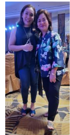
District Training 2022 at Greenleaf Hotel, General Santos City