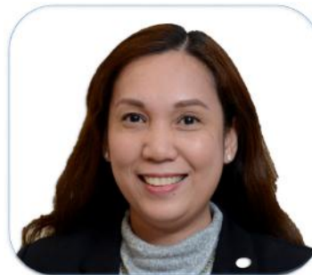
KRIZIA Z. TAN Travel Agency Travel Best