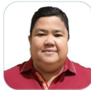
VILLA MERCEDES SILVA Apartment Rentals