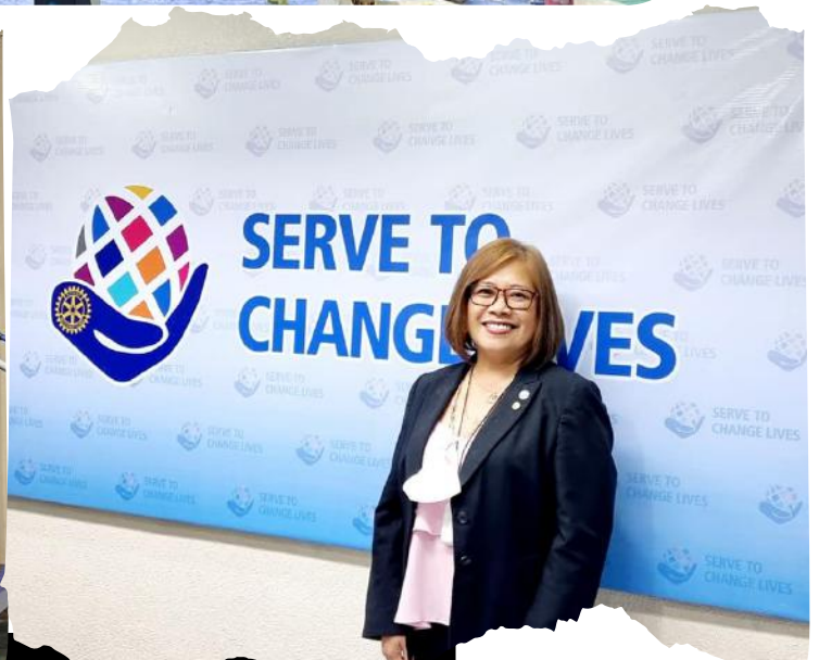
Regular Meeting and Induction of New Member at Roadway Inn